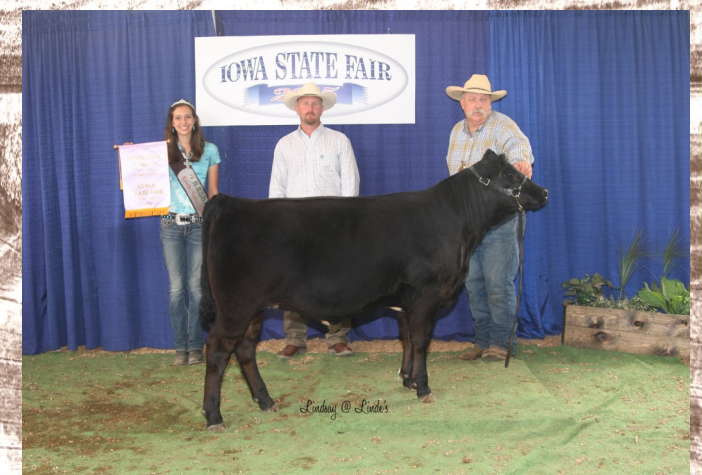
2015 Summer National Reserve Champion Poundmaker Female, DLCC Belle 115B, a December 20, 2014 daughter of DLCC Shur Loc 99W, owned by Leah Giess, Pierz, MN.