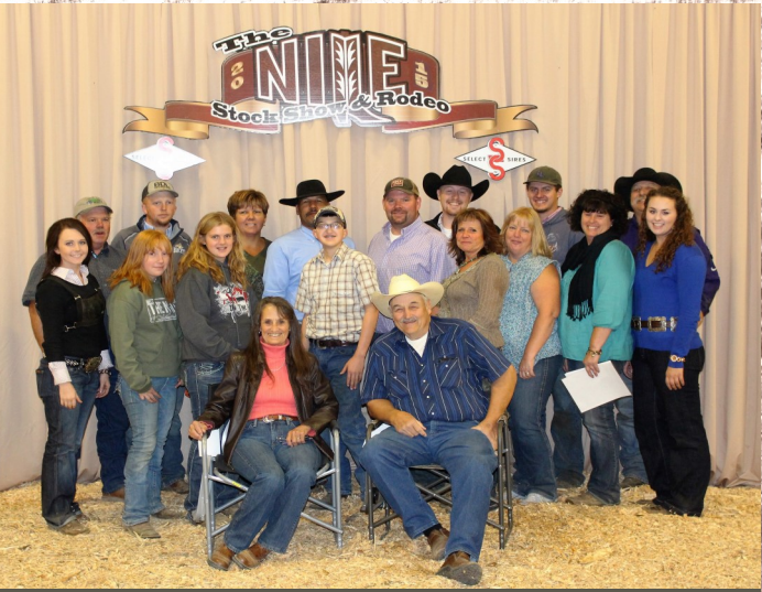
2015 NILE South Devon Show participants. Special thanks to the Western States South Devon Association for hosting the event.