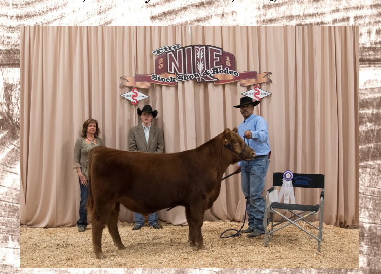
2015 Summer NILE Reserve Champion Poundmaker Bull, Haycow Bootlegger 437C, a March 20, 2015 son of DLCC Shur Loc 99W, shown by Haycow Cattle Co., Lincoln, CA.