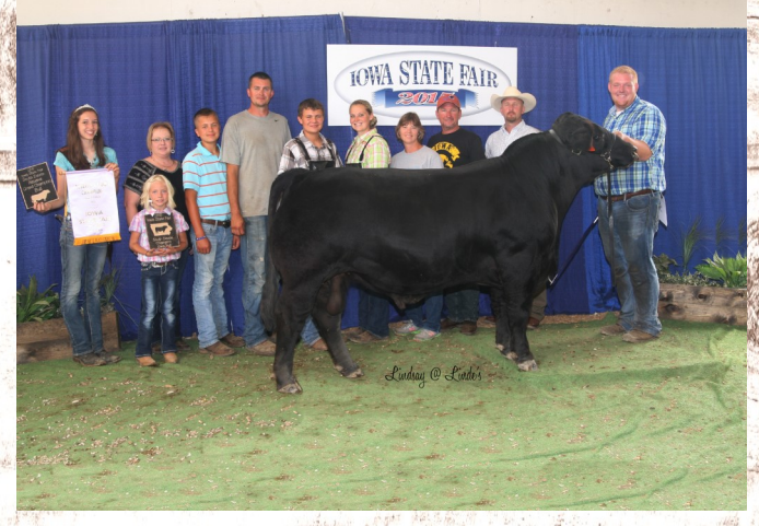
2015 Reserve Champion Bull, EVW Bobcat 465B, an April 21, 2014 son of TLC Captain Call, owned by JVM Cattle Company, Pella, IA and Hillcrest South Devon, Grinnell, IA.