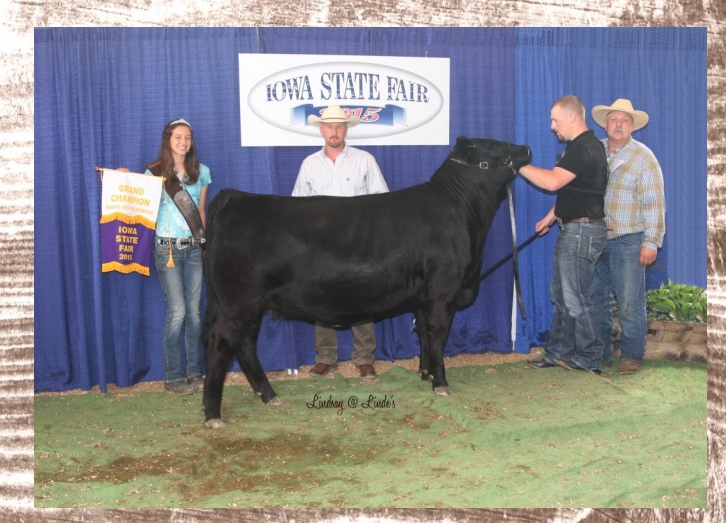
2015 Champion Female, DLCC Loop 19B, a March 21, 2014 daughter of MMM Untouchable, owned by Lane Giess, Pierz, MN.