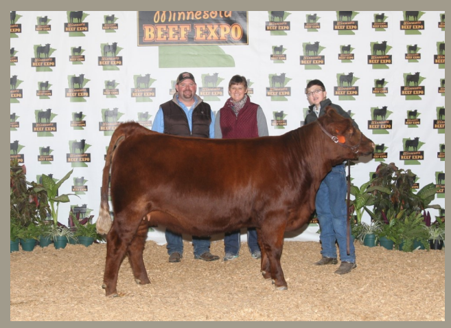
2015 Reserve Champion Female, MJB Bella 4585B, a 3/26/14 daughter of DLC The Rock 52, also shown by Kyle Stranberg, Maynard, MN.