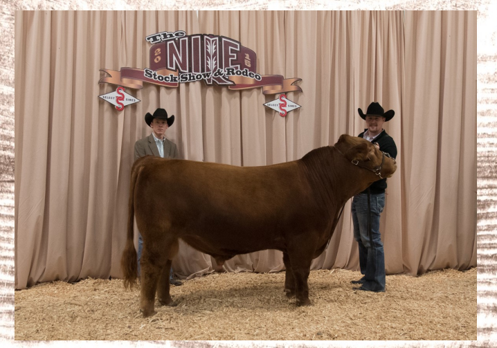
2015 Champion Bull, DLCC Two Step 84B, a May 12, 2014 son of DLCC Shur Loc 99W, owned by the Two-Step Syndicate.