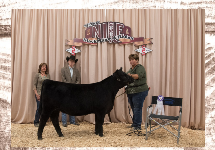
2015 NILE Champion Poundmaker Female, Haycow Tennessee Honey, a January 26, 2015 daughter of DLCC Shur Loc 99W, shown by Haycow Cattle Co., Lincoln, CA.