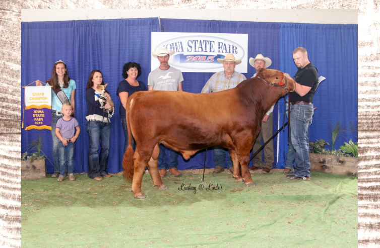
2015 Champion Bull, DLCC Two Step 84B, a May 12, 2014 son of DLCC Shur Loc 99W, owned by the Two-Step Syndicate.