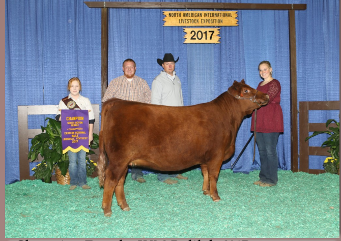
Champion Female: JVM Delilah 601D Sire: KNN Country Boy - Birthdate: 3/10/16 Shown by: JVM Cattle Company, Pella, IA