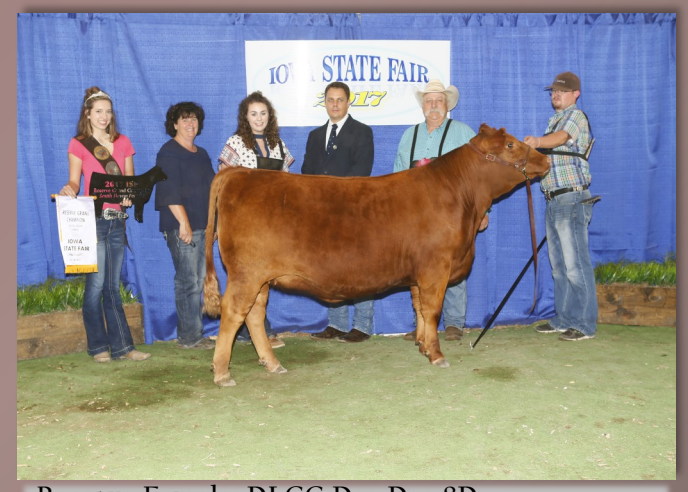
Reserve Female: DLCC Dee Dee 8D Sire: Gum Hill Red 530 - Birthdate: 3/1/16 Shown by: DLCC Ranch, Pierz, MN