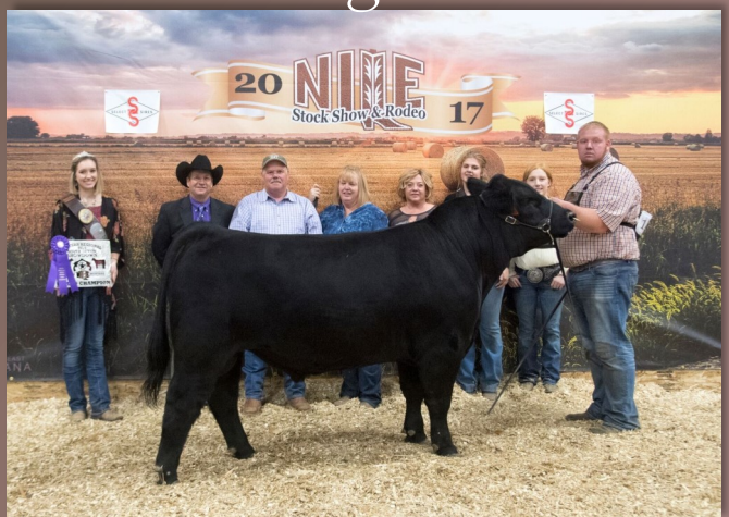
Champion Poundmaker Bull: JVM Dingus 651D Sire: JVM Big Oak - Birthdate: 4/14/16 Shown by: JVM Cattle Company, Pella, IA