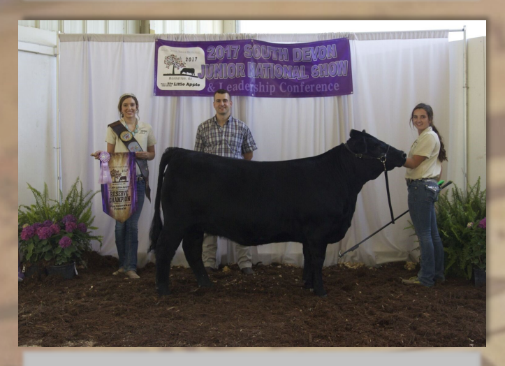
Reserve Poundmaker Female: Sire: WF Comm Bull Emilee White, Wadena, MN