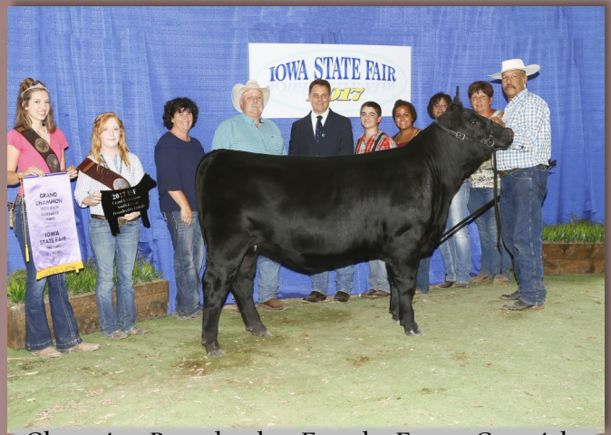
Champion Poundmaker Female: Fraser Cowgirl Sire: DLCC Whiplash 1Y - Birthdate: 8/15/16 Shown by: Fraser Ranch, Lincoln, CA