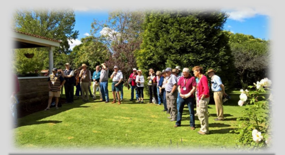
Group at Magpela South Devons