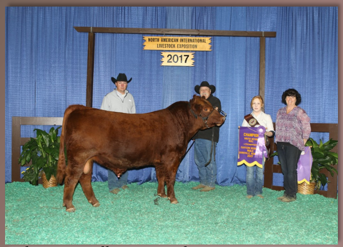
Champion Bull: DLCC Derby 64D Sire: DLCC Dodge City 78Y - Birthdate: 4/2/16 Shown by: DLCC Ranch, Pierz, MN