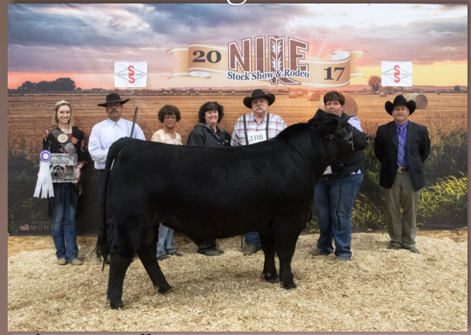
Champion Bull: DLCC DJ 95D Sire: DLCC Dodge City 78Y - Birthdate: 5/2/16 Shown by: Fraser Ranch, Lincoln, CA & DLCC