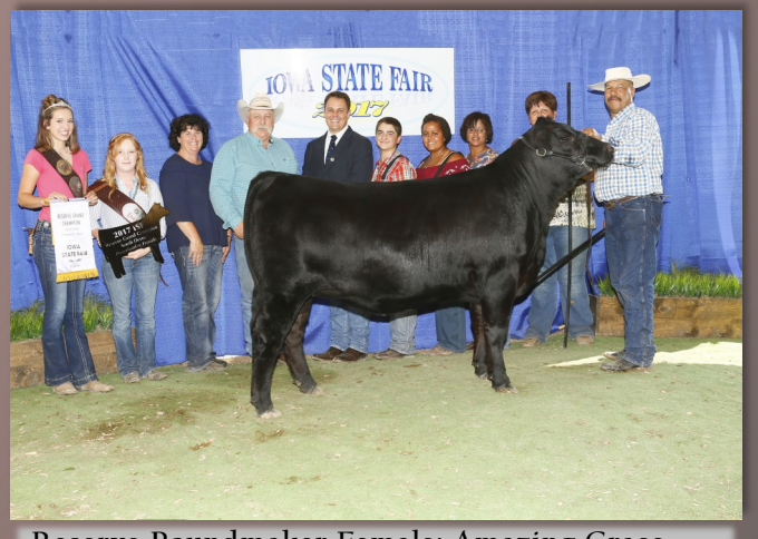
Reserve Poundmaker Female: Amazing Grace Sire: DLCC Whiplash 1Y - Birthdate: 6/23/16 Shown by: Fraser Ranch, Lincoln, CA