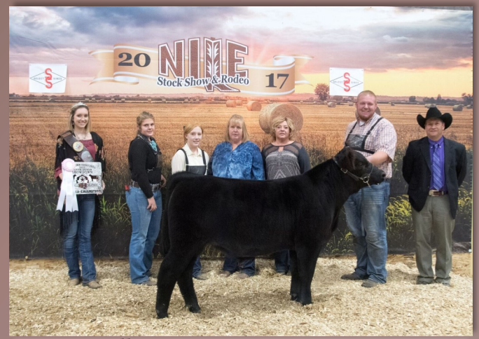
Reserve Bull: JVM Easton 750E Sire: Hillcrest 465B - Birthdate: 4/28/16 Shown by: JVM Cattle Company, Pella, IA