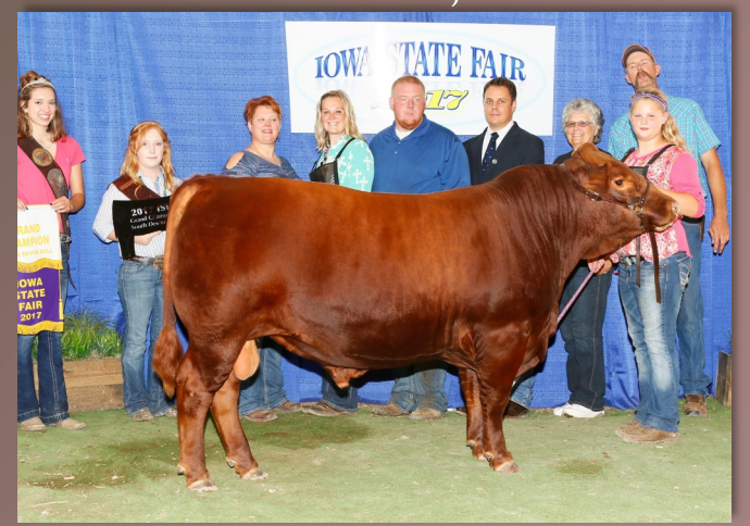
Champion Bull: WGF Badger Sire: JVM Zeke - Birthdate: 2/28/16

Shown by: Walnut Grove Farm, Valley Falls, KS.