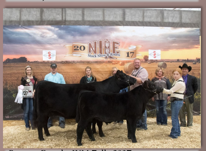
Reserve Female: JVM Zella 203Z Sire: MVM Sargent 654S - Birthdate: 3/30/15 Shown by: JVM Cattle Company, Pella, IA