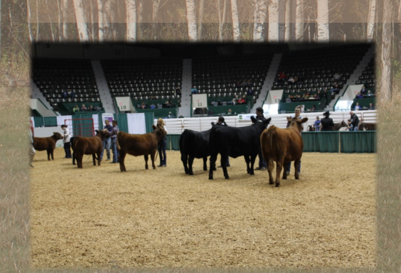
2017 Champion line-up MN Beef Expo

Special thanks to everyone who continue to participate in shows and activities and to the work of the regional associations who are working hard at creating new avenues to promote the breed and build membership within their organizations.