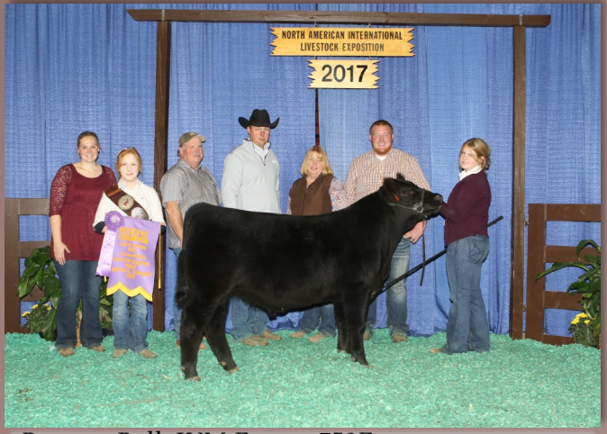
Reserve Bull: JVM Easton 750E Sire: Hillcrest 465B - Birthdate: 4/28/16 Shown by: JVM Cattle Company, Pella, IA