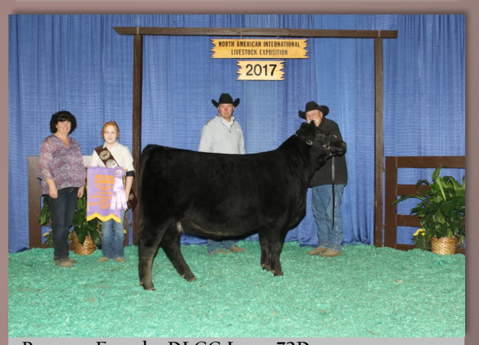
Reserve Female: DLCC Loop 72D Sire: DLCC Whiplash 1Y - Birthdate: 4/6/16 Shown by: DLCC Ranch, Pierz, MN