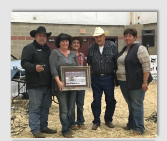
2017 Western Regional