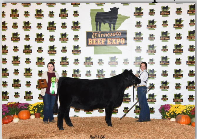
Champion Female: WF Silver

Sire: WF Commerial - Birthdate: 5/3/16 Shown by: Emilee White, Wadena, MN