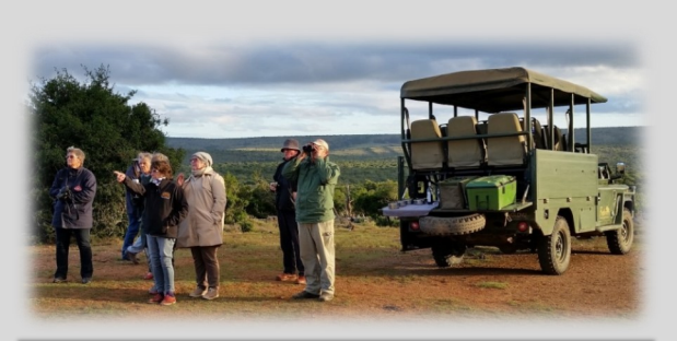
Pumba Game Reserve