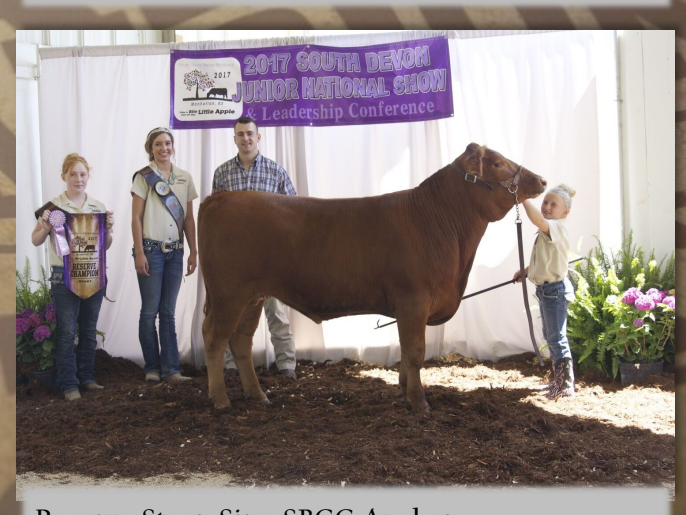
Reserve Steer-Sire: SBCC Anchor