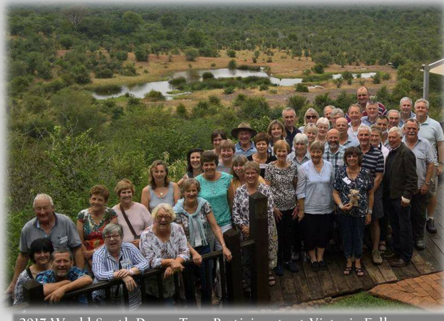
2017 World South Devon Tour Participants at Victoria Falls

South Africa is a land of huge contrasts - huge wealth and huge poverty. The people we met were wonderful and the South African hospitality hard to beat. The countryside was very different to what I had expected; I was expecting much more open country and less mountains. Maybe if we had gone further west, it may have been like that. I also had no idea that there was so much of South Aftrica that experienced snow. In fact, I quickly realized that I really didn't know much about South Af-