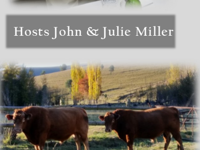
Winston South Devon Stud