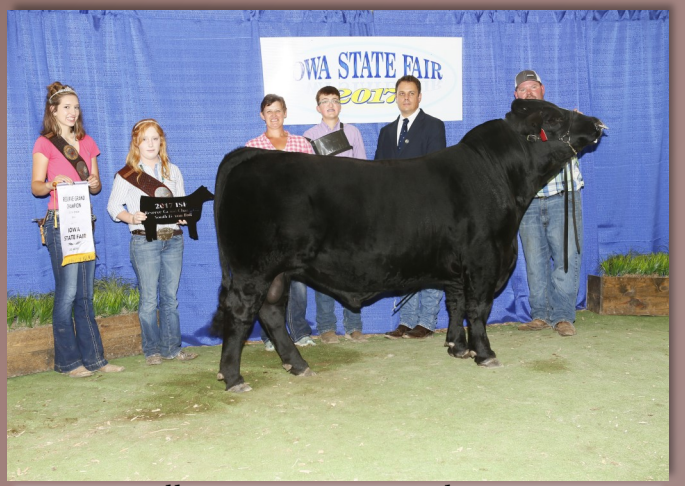
Reserve Bull: LCOC Uptown Funk Sire: Cimarron Triumph - Birthdate: 1/27/16 Shown by: Stranberg Cattle Co., Maynard, MN