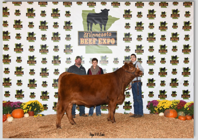
Reserve Female: SC Sydney 1D

Sire: WF Commerial - Birthdate: 5/3/16 Shown by: Emilee White, Wadena, MN