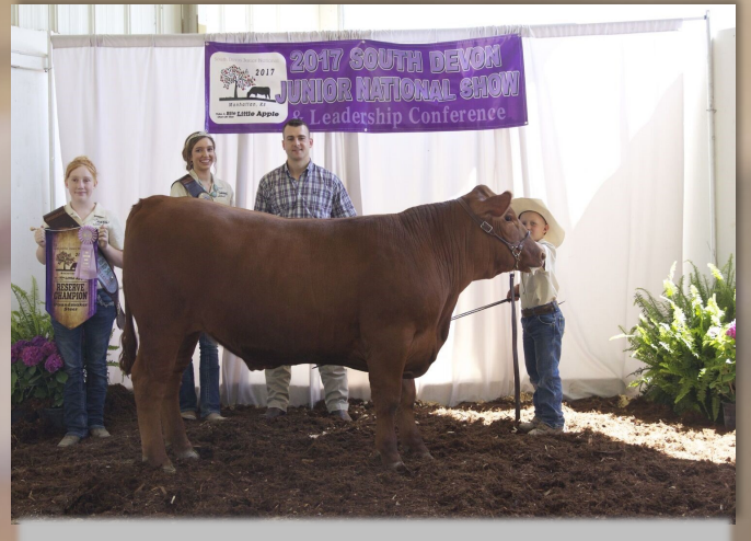
Reserve Poundmaker Steer - Sire: SBCC Absolut Braxton Boyce, Holton, KS