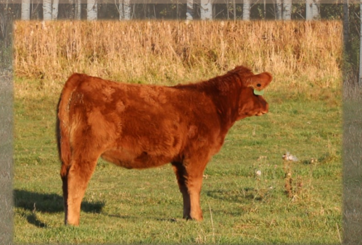
2018 NASDA Donation Heifer