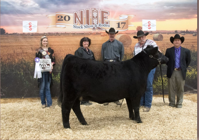
Champion Female: DLCC Loop 72D Sire: DLCC Whiplash 1Y - Birthdate: 4/6/16 Shown by: DLCC Ranch, Pierz, MN