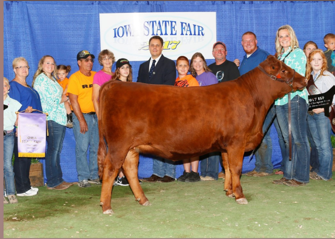
Champion Female: JVM Delilah 601D Sire: KNN Country Boy - Birthdate: 3/10/16 Shown by: JVM Cattle Company, Pella, IA

Shown by: Walnut Grove Farm, Valley Falls, KS.